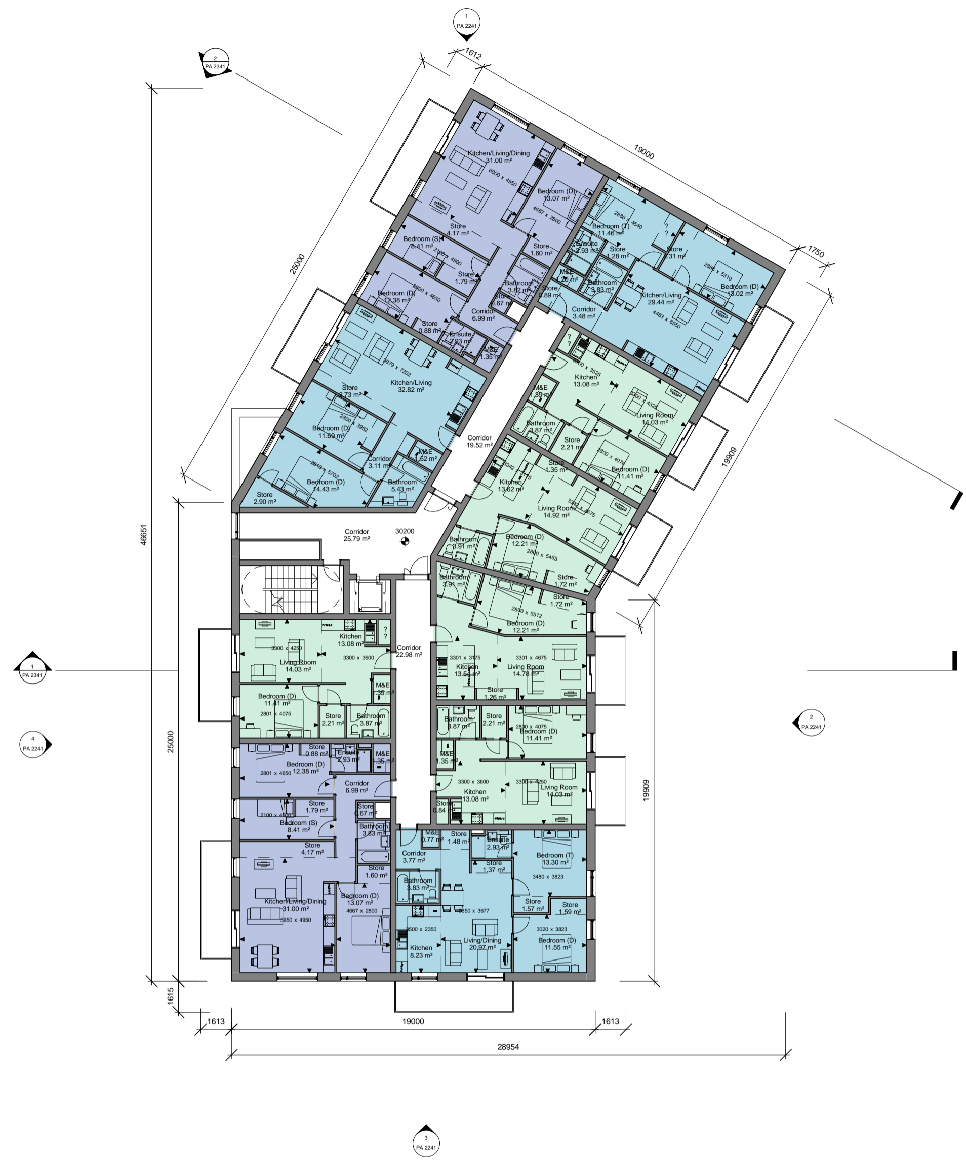
2 Block D - Level 01 1:200