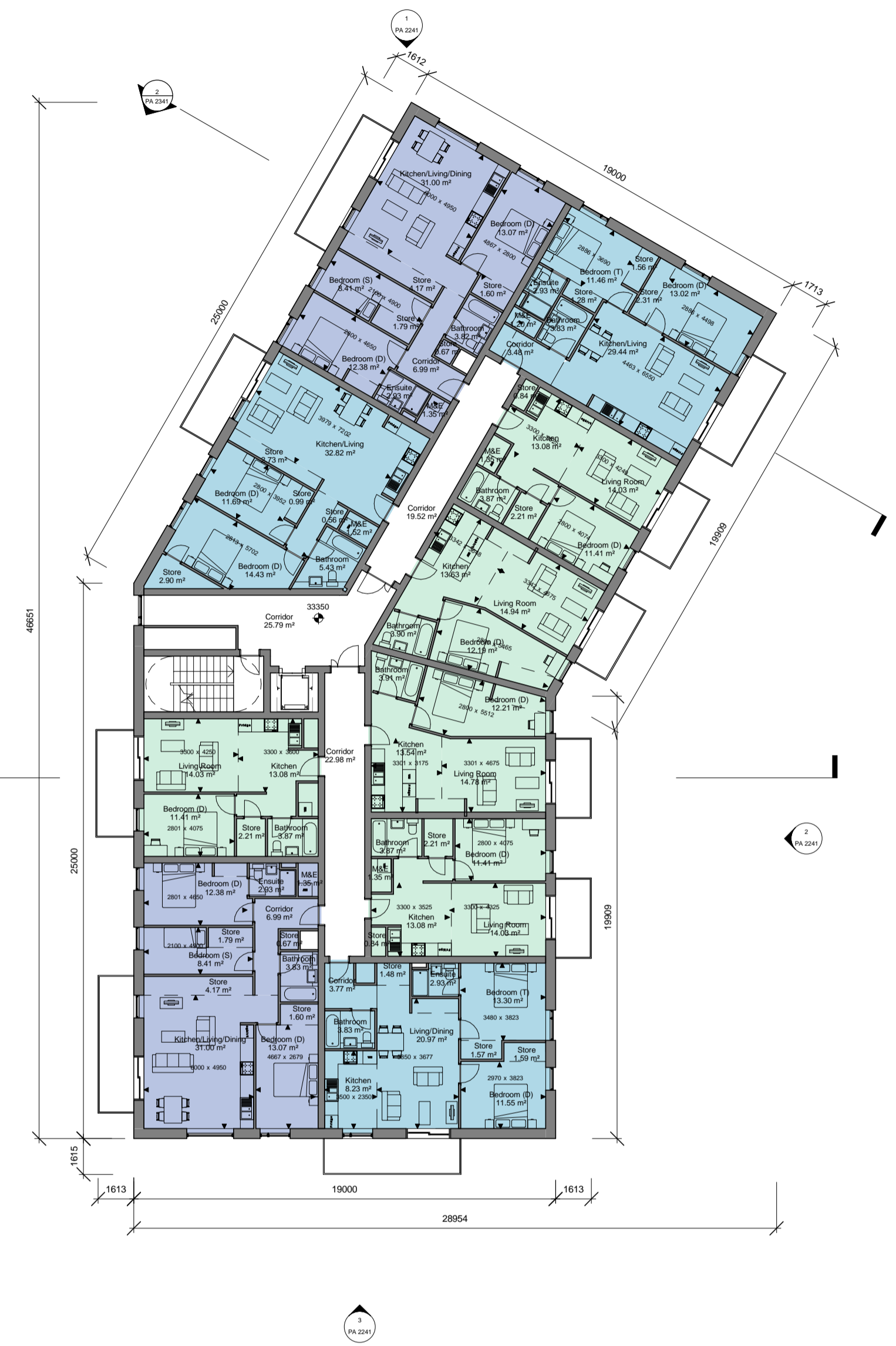
3 Block D - Level 02 1:200