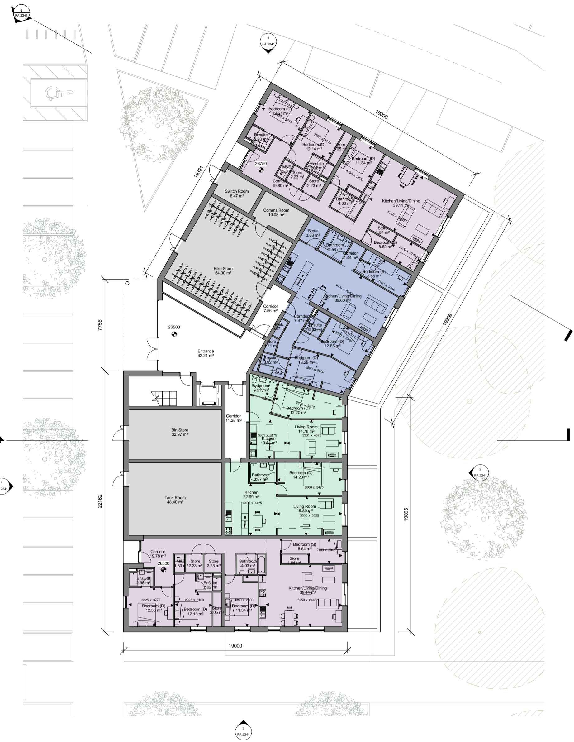
1 Block D - Level 00 1:200